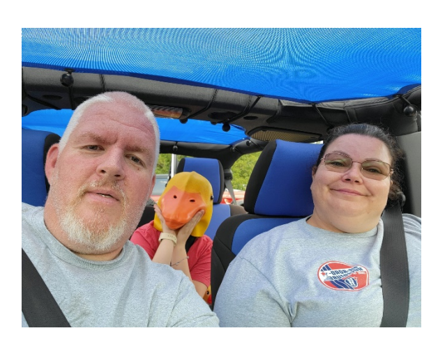
Eureka Springs Jeep Jam September 15 - 18

Our next event was the Eureka Springs Jeep Jam, down in, you guessed it, Eureka Springs, Arkansas. They were looking for about 454 Jeep so that they could break the record for Jeeps in a parade. Well, that record was decimated with about 800 Jeeps! This of course led to a complete disaster in traffic control and nobody knew